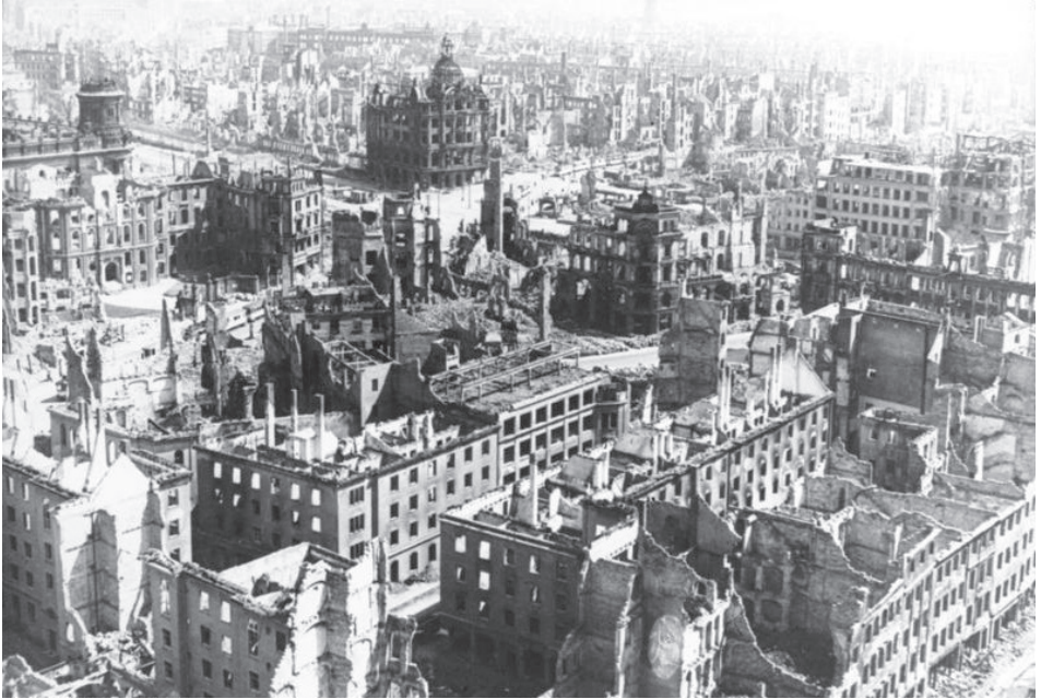
Dresden after February 1945 bombings.