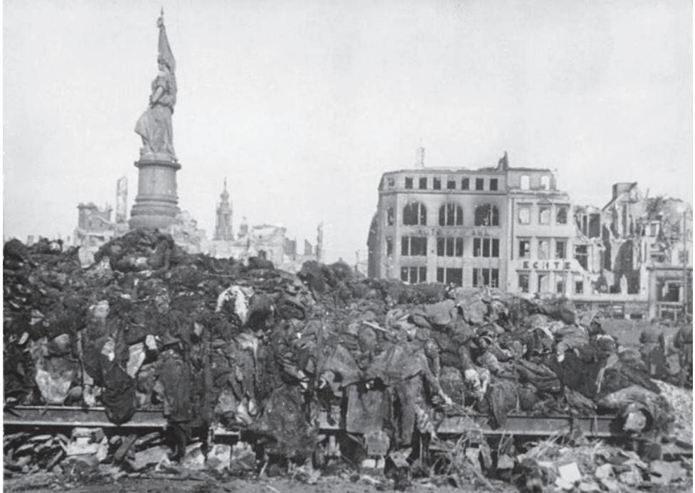
Dresden after February 1945 bombings.