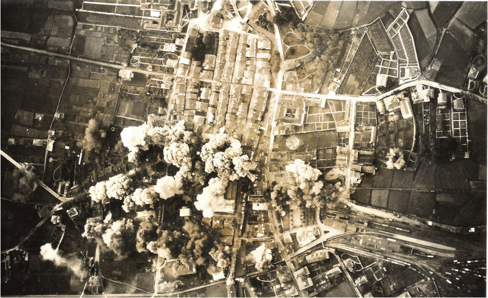
Durango under the Italian bombs on March 31, 1937 (Rino Zitelli).