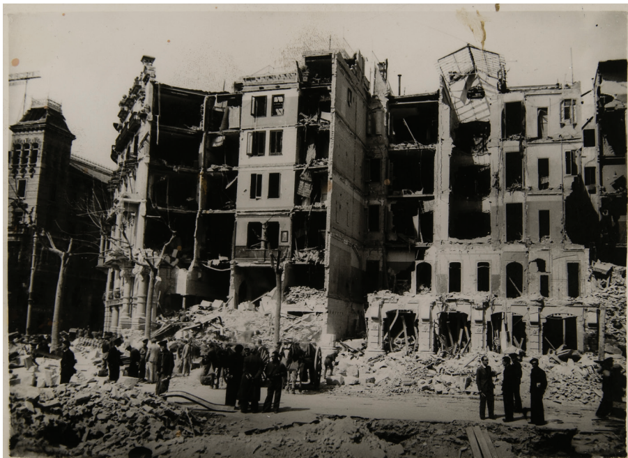
Destruction caused in the center of Barcelona by the bombings of March 16, 17 and 18, 1938.