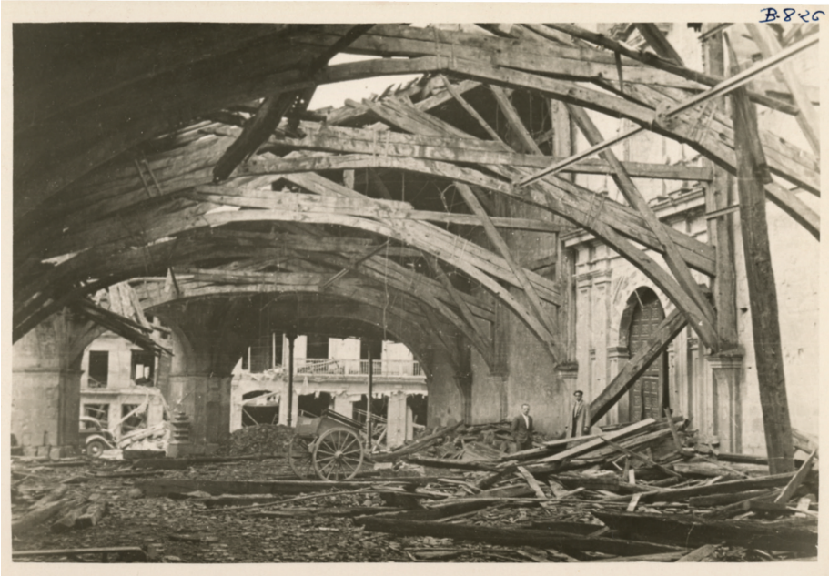
Portico of the church of Santa Maria de Uribarri used as a market place at the moment of the bombing.