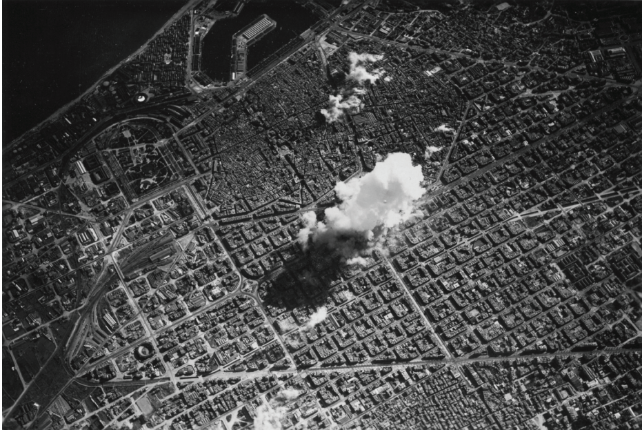
Bombing on the city of Barcelona on March 17, 1938 by the Italian Legionnaire Aviation. A bomb hit a trilite truck on its way through the Gran Via.